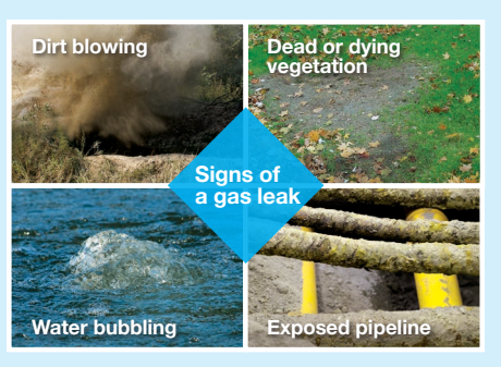
Leaking natural gas may throw dirt up into the air, kill grass or plants, or make bubbles in water. Gas pipelines exposed by fires or floods may be a source of leaks.