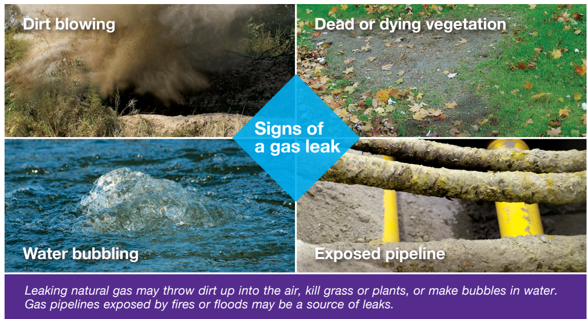
Leaking natural gas may throw dirt up into the air, kill grass or plants, or make bubbles in water. Gas pipelines exposed by fires or floods may be a source of leaks.