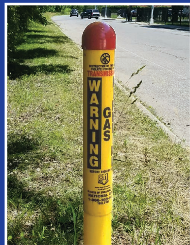
Natural gas pipeline markers are generally yellow and black. They're placed near pipelines but not necessarily directly on top of them.

In addition to buried pipelines, our natural gas distribution system includes aboveground pipelines that run under bridges built over roads and waterways, other aboveground gas facilities and liquefied natural gas (LNG) transport trailers. These trailers carry LNG over roads and interstate highways to deliver LNG to acceptance sites, where we re-gasify and deliver it through our pipelines during periods of high demand.