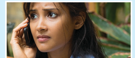
Once evacuated and in a safe location, call 911 and National Grid to report a suspected gas leak or possible pipeline damage – no damage is too small to report.