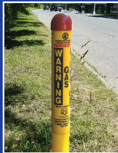
Natural gas pipeline markers are generally yellow and black. They're placed near pipelines but not necessarily directly on top of them.

In addition to buried pipelines, our natural gas distribution system includes aboveground pipelines that run under bridges built over roads and waterways, other aboveground gas facilities and liquefied natural gas (LNG) transport trailers. These trailers carry LNG over roads and interstate highways to deliver it to the Portsmouth LNG station located on Old Mill Lane in Portsmouth, Rhode Island, where we re-gasify and deliver it through our pipelines during periods of high demand.