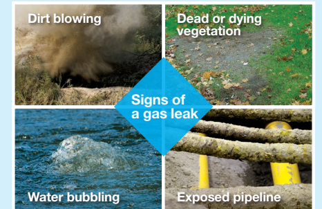
Leaking natural gas may throw dirt up into the air, kill grass or plants, or make bubbles in water. Gas pipelines exposed by fires or floods may be a source of leaks.

LISTEN – You may hear an unusual noise like roaring, hissing or whistling as gas escapes from a pipe.