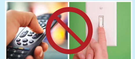
Natural gas requires air and an ignition source in order to burn. A spark from a light switch, phone or electrical device can ignite leaking gas.

BEWARE: A spark from any of these items could ignite leaking gas, causing a fire or explosion.