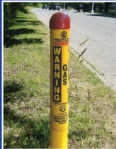
Natural gas pipeline markers are generally yellow and black. They're placed near pipelines but not necessarily directly on top of them.

In addition to buried pipelines, our natural gas distribution system includes aboveground pipelines that run under bridges built over roads and waterways, other aboveground gas facilities and compressed natural gas (CNG) transport trailers. These trailers carry CNG over roads and interstate highways to deliver it to the Moreau CNG station on Washburn Road in Gansevoort, New York, where we deliver it through our pipelines during periods of high demand.