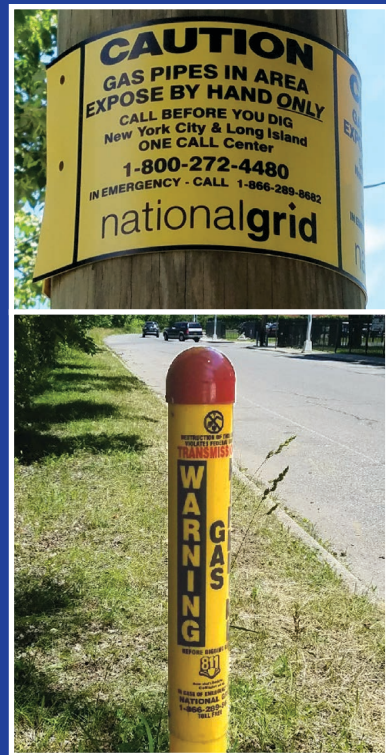
Natural gas pipeline markers are generally yellow and black. They're placed near pipelines but not necessarily directly on top of them.

Call 911 and National Grid if you make ANY contact with a natural gas line, even if you just nick the pipeline or damage its coating. Also notify 811.