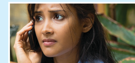
Once evacuated and in a safe location, call 911 and National Grid to report a suspected gas leak or possible pipeline damage – no damage is too small to report.