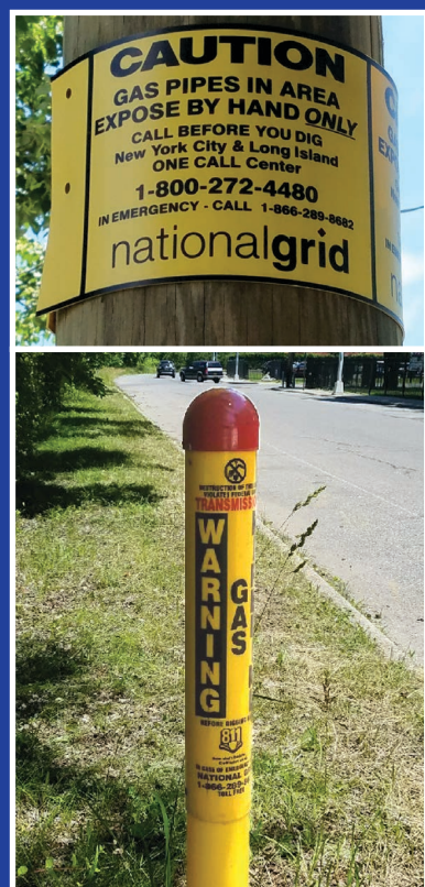
Natural gas pipeline markers are generally yellow and black. They're placed near pipelines but not necessarily directly on top of them.

Call 911 and National Grid if you make ANY contact with a natural gas line, even if you just nick the pipeline or damage its coating. Also notify 811.