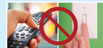
Natural gas requires air and an ignition source in order to burn. A spark from a light switch, phone or electrical device can ignite leaking gas.

BEWARE: A spark from any of these items could ignite leaking gas, causing a fire or explosion.