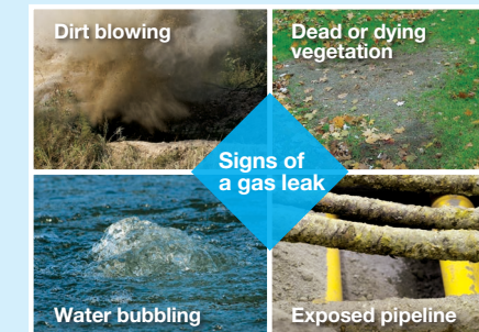
Leaking natural gas may throw dirt up into the air, kill grass or plants, or make bubbles in water. Gas pipelines exposed by fires or floods may be a source of leaks.

LISTEN – You may hear an unusual noise like roaring, hissing or whistling as gas escapes from a pipe.