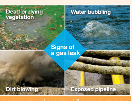
Leaking natural gas may kill grass or plants, make bubbles in water or throw dirt into the air. Gas pipelines exposed by fires or floods may be a source of leaks.