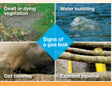
Leaking natural gas may kill grass or plants, make bubbles in water or throw dirt into the air. Gas pipelines exposed by fires or floods may be a source of leaks.