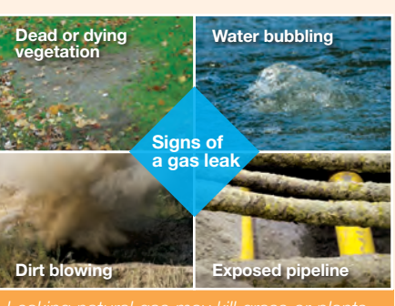
Leaking natural gas may kill grass or plants, make bubbles in water or throw dirt into the air. Gas pipelines exposed by fires or floods may be a source of leaks.