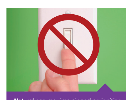
Natural gas requires air and an ignition source in order to burn. A spark from a light switch, phone or electrical appliance can ignite leaking gas.