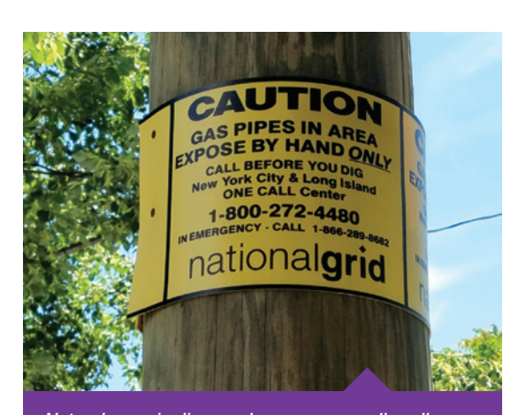
Natural gas pipeline markers are generally yellow and black. They're placed near pipelines but not necessarily directly on top of them.

Pipeline markers do not indicate the exact depth or location of transmission lines and are not present in all areas. Neither aboveground markers nor NPMS maps show the location of distribution main lines or service lines that carry natural gas to homes and businesses. Never use pipeline markers or maps as a substitute for calling 811 to have all utility lines in your dig area located and marked.