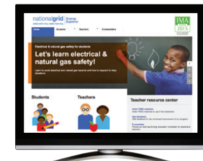
To learn more about gas safety visit our energy education website: ngridenergyworld.com.

We require free and clear access to our pipelines at all times for inspections and periodic maintenance. Any construction activity or obstructions of the right-of-way are prohibited. Keeping our rights-of-way cleared of vegetation also provides visibility for aerial pipeline patrols and leak detection.