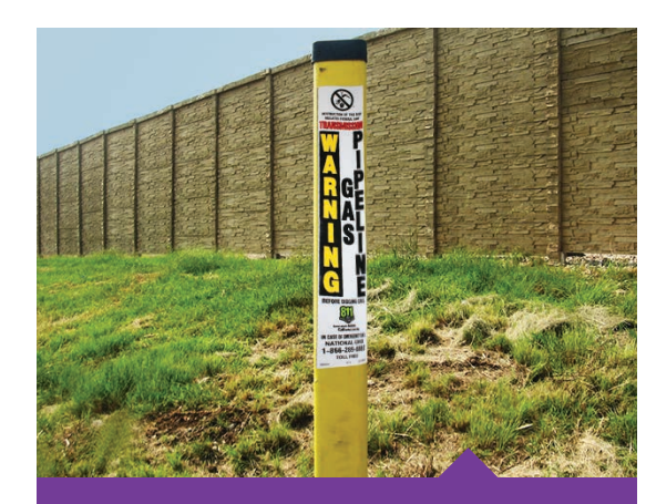
Natural gas pipeline markers are generally yellow and black. They're placed near pipelines but not necessarily directly on top of them.

Pipeline markers do not indicate the exact depth or location of transmission lines and are not present in all areas. Neither aboveground markers nor NPMS maps show the location of distribution main lines or service lines that carry natural gas to homes and businesses. Never use pipeline markers or maps as a substitute for calling 811 to have all utility lines in your dig area located and marked.