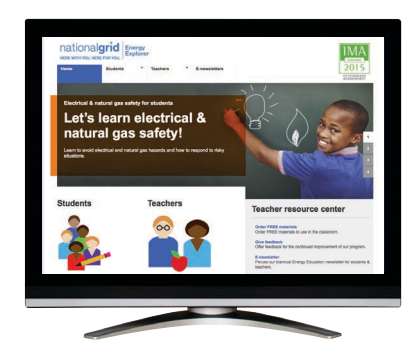
To learn more about gas safety visit our energy education website: ngridenergyworld.com.

We require free and clear access to our pipelines at all times for inspections and periodic maintenance. Any construction activity or obstructions of the right-of-way are prohibited. Keeping our rights-of-way cleared of vegetation also provides visibility for aerial pipeline patrols and leak detection.