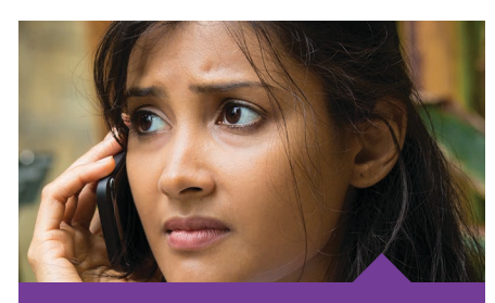
Once evacuated and in a safe location, call to report suspected gas leaks or possible pipeline damage – no damage is too small to report.