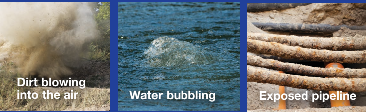
Dirt blowing into the air