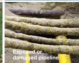
Exposed or damaged pipeline