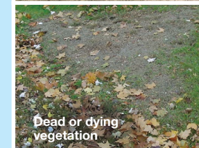
Dead or dying vegetation