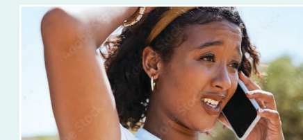
Once evacuated and in a safe location, call 911 and National Grid to report a suspected gas leak or possible pipeline damage – no damage is too small to report.