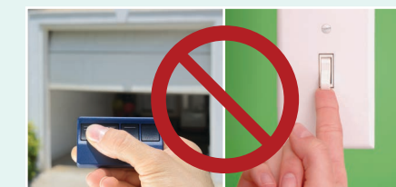
Danger! A spark from a garage door opener, light switch, cell phone or other electrical device can ignite leaking gas.

BEWARE: A spark from any of these items could ignite leaking gas, causing a fire or explosion.