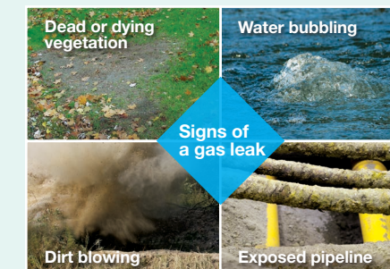
Leaking natural gas may kill grass or plants, make bubbles in water or throw dirt into the air. Gas pipelines exposed by fires or floods may be a source of leaks.