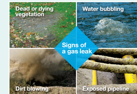
Leaking natural gas may kill grass or plants, make bubbles in water or throw dirt into the air. Gas pipelines exposed by fires or floods may be a source of leaks.