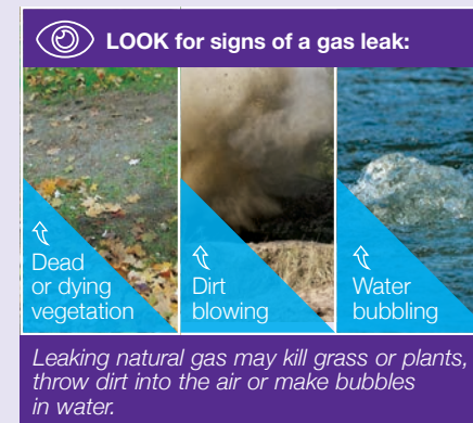
Leaking natural gas may kill grass or plants, throw dirt into the air or make bubbles in water.