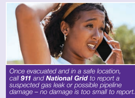
Once evacuated and in a safe location, call 911 and National Grid to report a suspected gas leak or possible pipeline damage – no damage is too small to report.